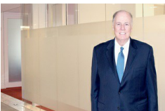
Thomas E. Donilon